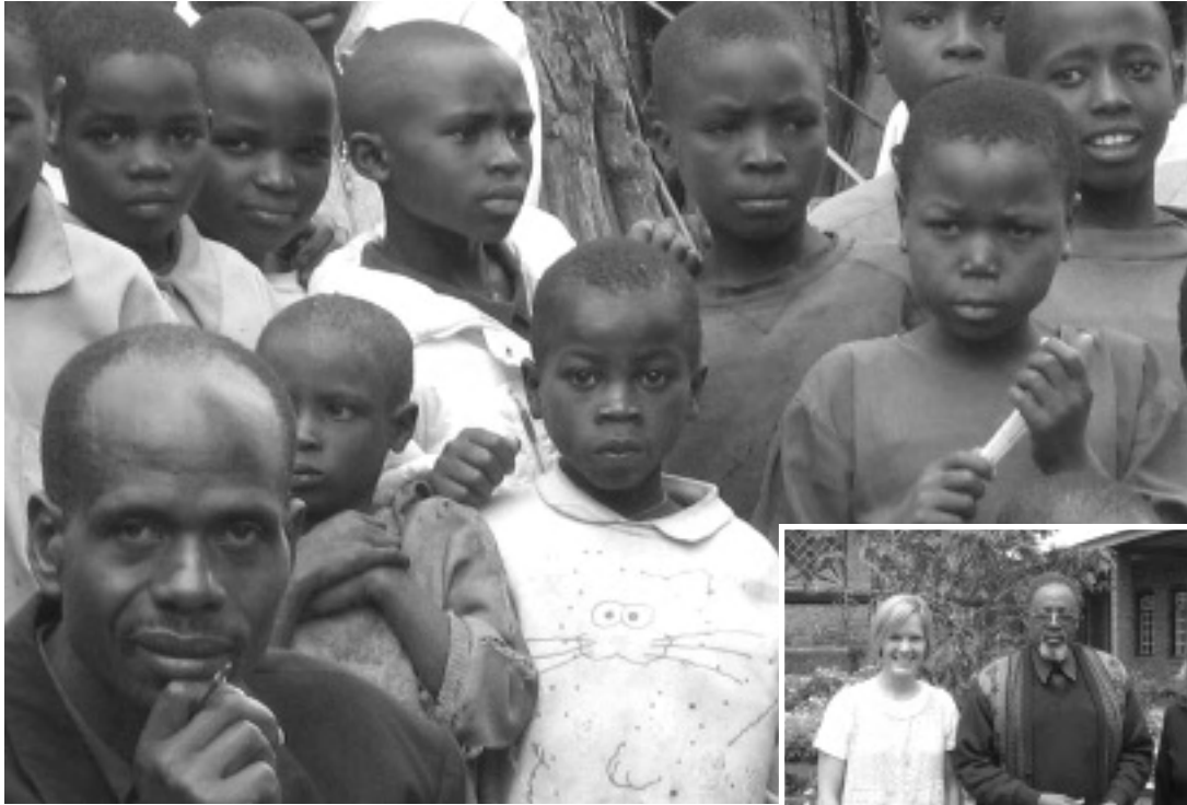
Rwandan children. Their country needs not just reconciliation, but a rebuilt economy.