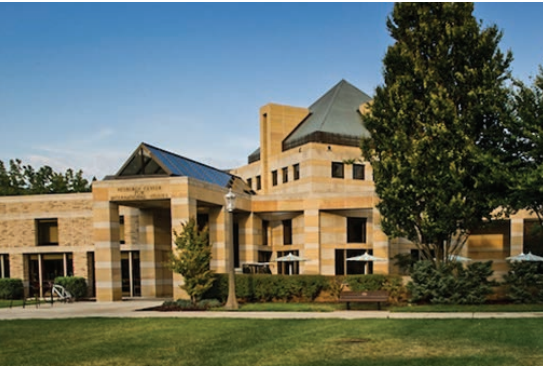
Hesburgh Center for International Studies