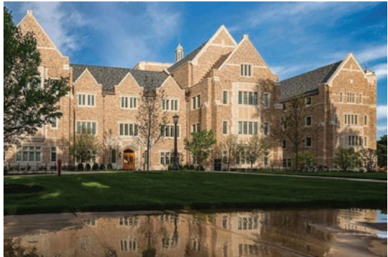
Jenkins and Nanovic Halls